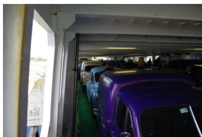
Three little Morries on the ferry.