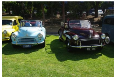
Baby Blue and Ruby