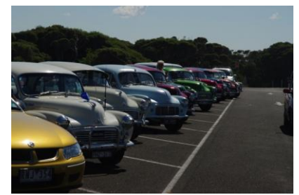
The line up!