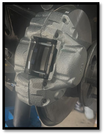
Page 24 of 28