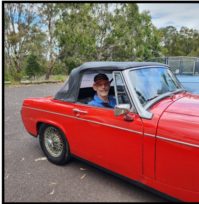
A pretty cool looking MMCCV member!