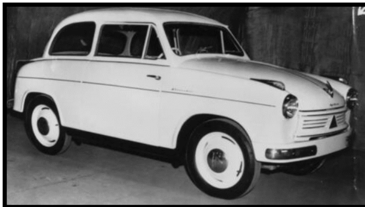
IMAGE is a REFERENCE PICTURE ONLY of car what would look like restored

Lloyd Hartnett panel van which was my father-in-law's. Unfortunately, he has passed, so we are looking to sell the vehicle and are keen to find someone interested in these unique vehicles. It has been stored in a container at Mt Mercer 1.5 Hours from Melbourne (35 minutes from Ballarat) for some time.